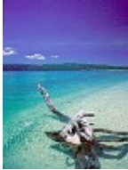
03 August 2005

Vanuatu, an archipelago of 83 beautiful tropical islands, formerly the New Hebrides, is a popular South Pacific tourist destination. The country, which was formerly ruled as a joint condominium of the French and British governments, obtained independence in 1980.