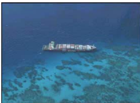
Bunga Teratai Satu aground on Sudbury Reef 62

The Bunga Teratai Satu's cargo manifest at the time of the grounding indicated the vessel was carrying 857 containers, twelve of which were identified as carrying dangerous goods amounting to approximately 126 tonnes. 60 The dangerous goods included classes of flammable liquids, toxic substances, corrosive material and other miscellaneous goods. 61