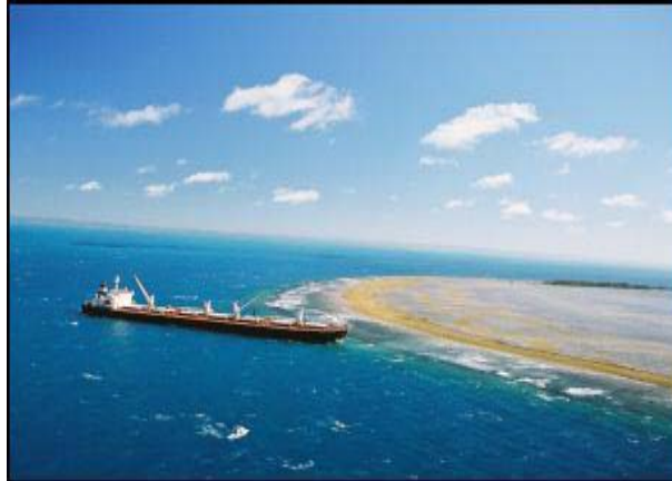
Doric Chariot Aground on Piper Reef 94

Reef. 90 At the time of the grounding the Doric Chariot was proceeding at a speed of 10 knots, 91 had a licensed marine pilot on board, was loaded with 62 000 tonnes of coal, 375 tonnes of fuel oil and 37 tonnes of diesel. 92 Following initial attempts to float the vessel, the Doric Chariot was eventually refloated on the afternoon of 6 August 2002, 93 some eight days after the vessel first grounded on the reef.