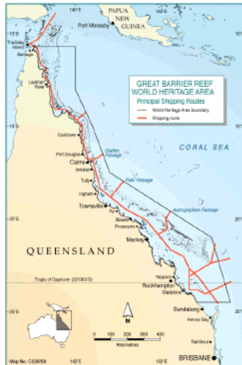
Great Barrier Reef World Heritage Area Principal Shipping Routes 24

Of the commercial ships using the Great Barrier Reef, approximately 42% are bulk carriers, between 5% and 10% tankers, 24% container carriers, 22% general cargo with the balance comprising miscellaneous classifications. 25 Of the tankers, most are on northerly transits either in ballast or carrying refined petroleum products serving ports geographically located to the north of Brisbane. Outside of commercial cargo vessel movements, approximately 1500 tourism vessels and 25 000 commercial and recreational vessels operate in the Great Barrier Reef. 26