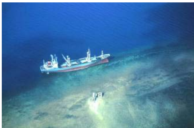
Peacock Aground on Piper Reef 44

The Australian Transport Safety Bureau 45 (ATSB) report into the grounding of the Peacock concludes the incident was a result of the vessel's failure to alter course as it approached from the north with the reef right ahead. 46 The ATSB report goes on to furnish nine factors that it considered to have contributed to the grounding. 47 From these nine factors it is clear the loss of situational awareness, the effects of fatigue and a lack of planning and monitoring (at the strategic, management and operational levels) are material themes, generated as a result of personal and organisational failings. From a professional mariner's perspective, the error chain was therefore clear and easily capable of intervention and arrest at any time prior to the grounding. Yet the grounding demonstrates how industry practices have once again allowed such trends to continue to the point of both economic and physical harm. There is little room left to doubt that industry practices led to the grounding of the Peacock by 'human error'. 48